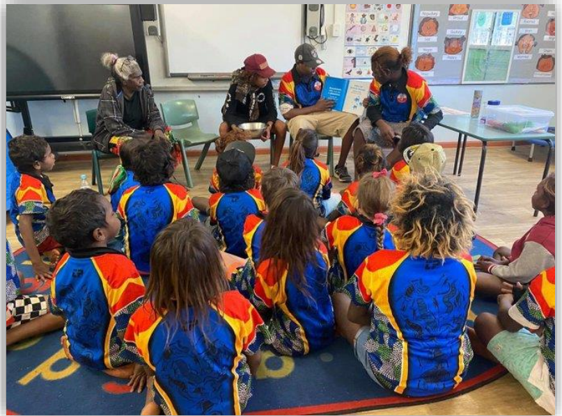
Senior Boys reading Bigismob Jigiwan Dog to Year 2/3 students