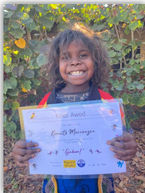
Each week at assembly we give an award for good work in Kriol lessons