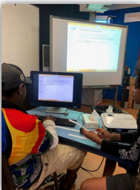
Senior Boys adding Kriol articles to the internet on Wikipedia