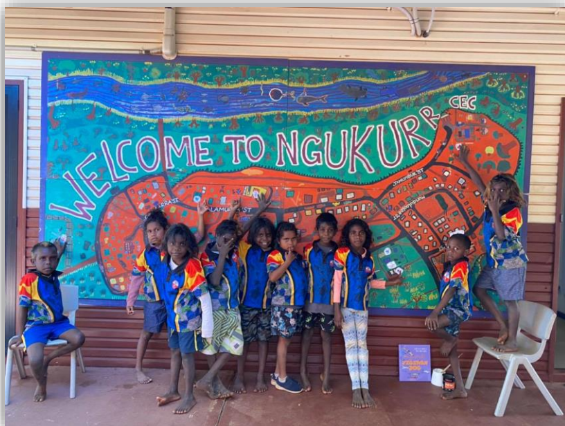
Year 1 / 2 Students learning to read maps in their Kriol lesson